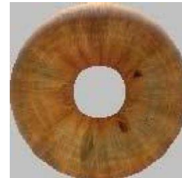
Fig.II.II BMP picture as Stego-picture

What s more, memory restrictions of such gadgets? The customer and the server utilize two 128-bit keys, one for every course of information travel. That is, one key is utilized to scramble the information in the customer and decode it in the server, and the other is utilized to scramble the information in the server and decode it in the customer. Towards the beginning of each customer session, the server arbitrarily creates this pair of keys and stores them in the customer's particular passage in the database. The server then encodes these session keys utilizing the customer's 64-bit pin code cushioned to a 64-bit shared mystery known